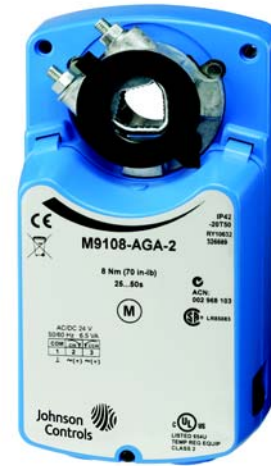
M9108 Series Electric Non-Spring-Return Actuators

The -GGx, -HGx, and -JGx models employ noise-filtering techniques on the control signal to eliminate repositioning due to line noise.